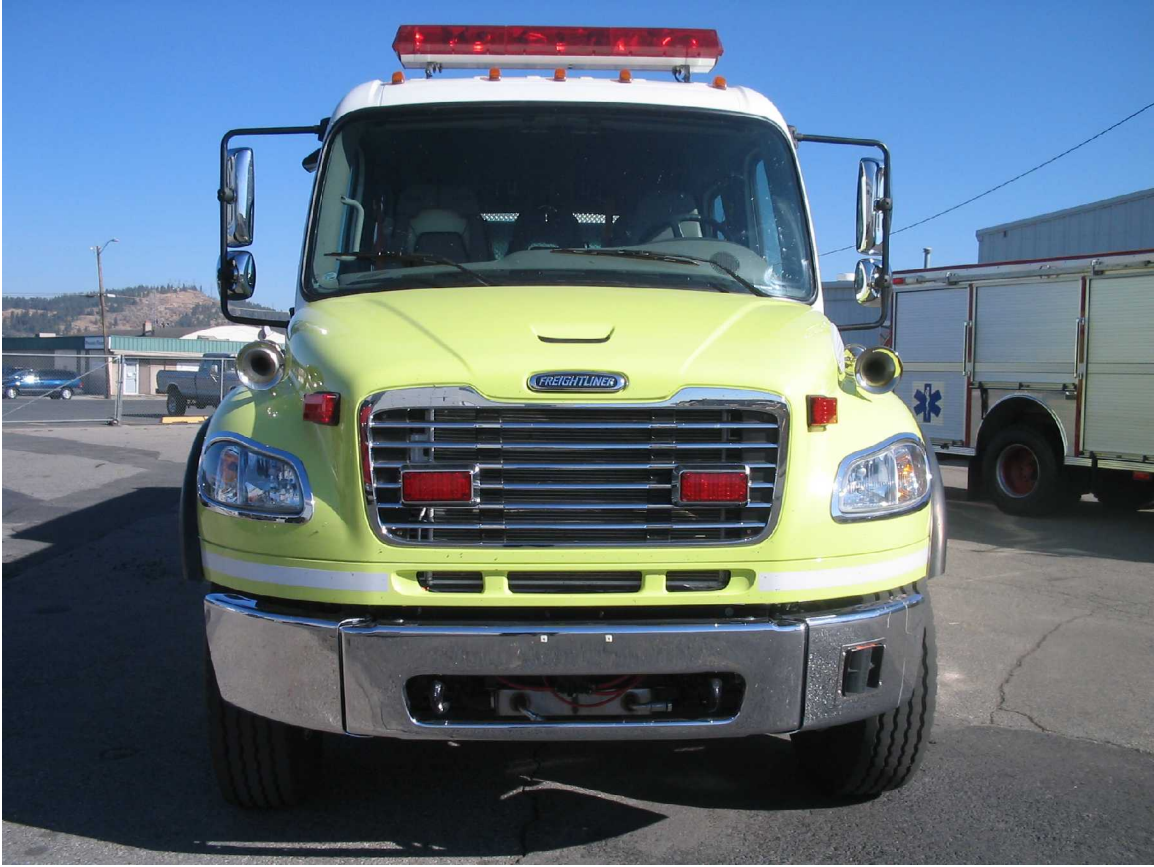
FREIGHTLINER M-2 4 DOOR CHASSIS WITH 315 HP CUMMINS DIESEL ENGINE & AUTOMATIC TRANSMISSION CHROME FRONT BUMPER WITH RECESSED ELECTRONIC SPEAKER, CODE 3 LED FRONT EMERGENCY LIGHTING KUSSMAUL AUTO EJECTOR WITH BATTERY & CHASSIS AIR CONDITIONER LARGE UNDER CREW CAB STORAGE COMPARTMENT & ALUMINUM CAB ACCESS STEP OVER LAID