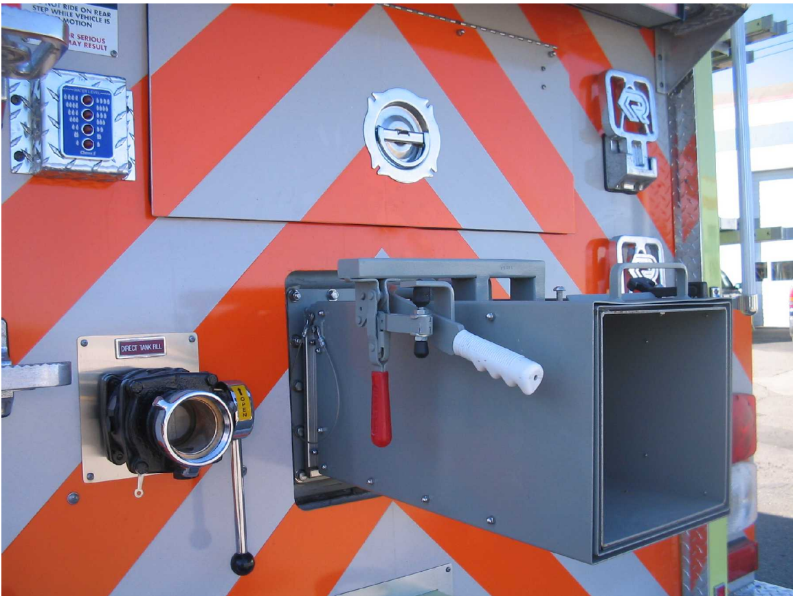
2100 GALLON FOLDING TANK