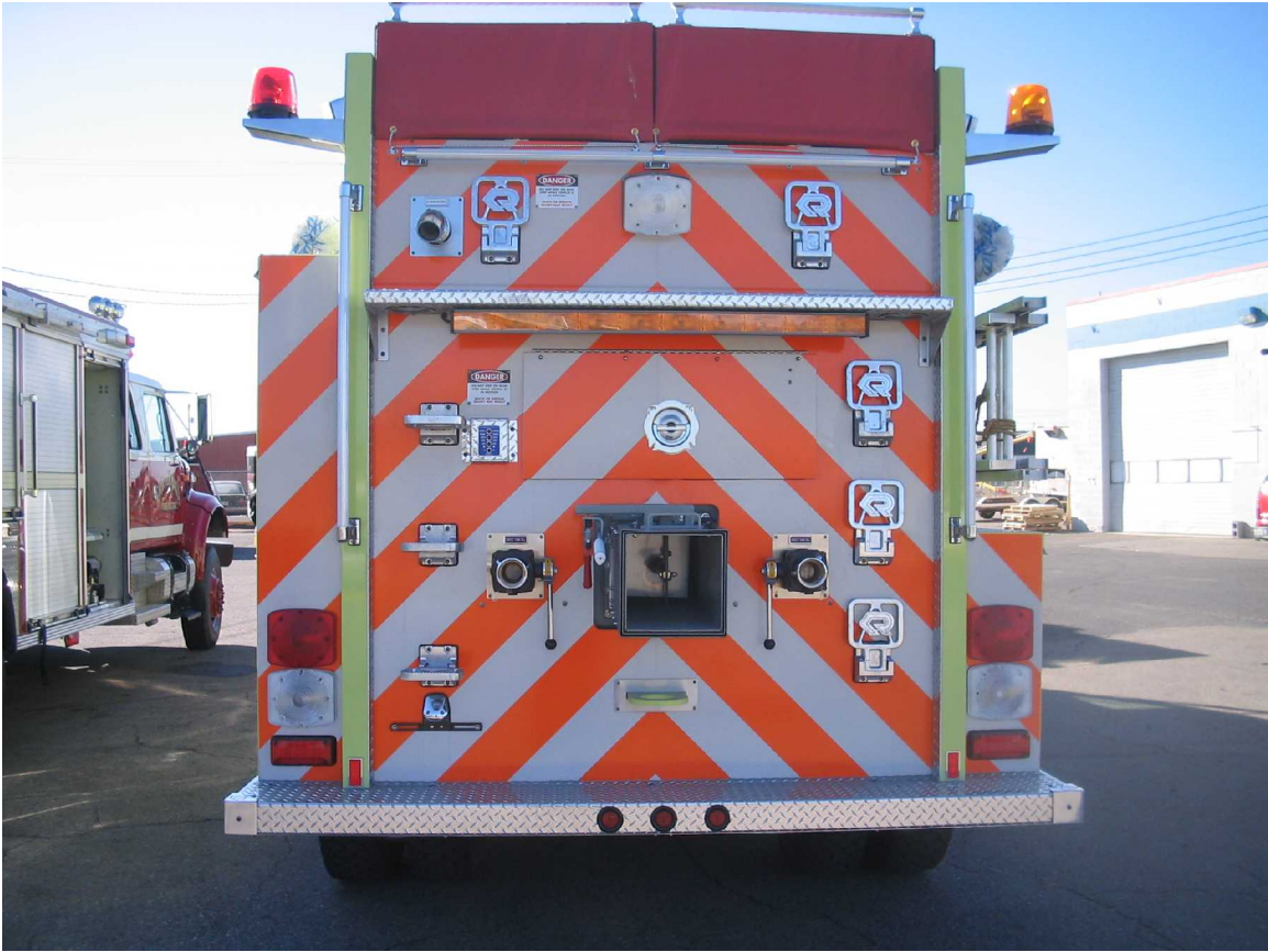
CHEVRON REAR SAFETY STRIPPING