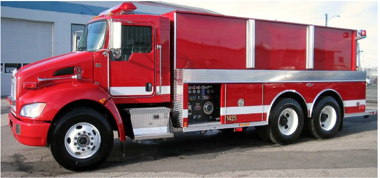
2500 GALLON FIRELINE TENDER BY