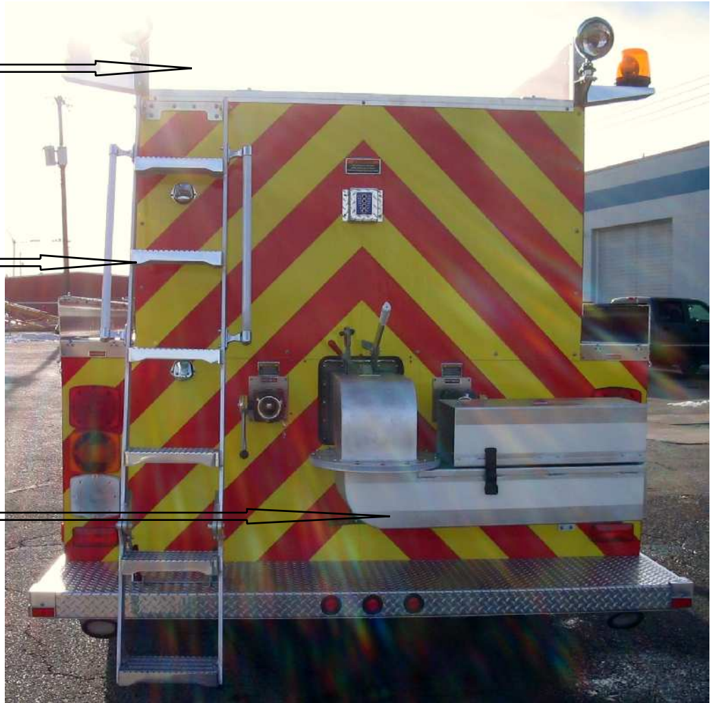
TWO 2 1/2" DIRECT TANK FILLS REAR MOUNTED