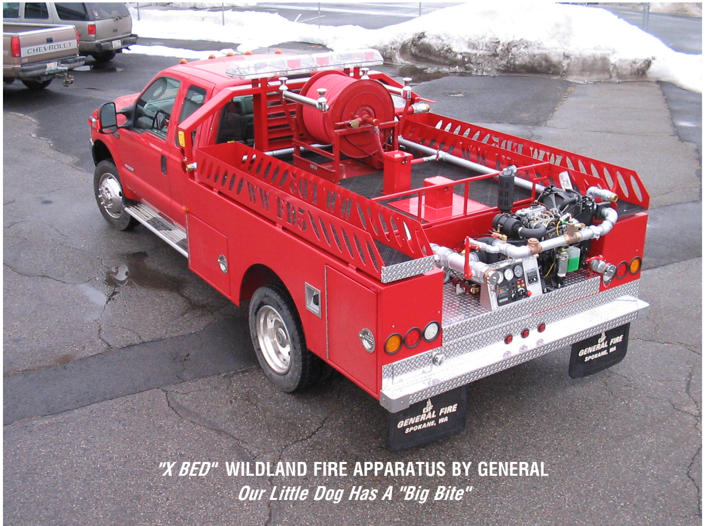
"X-BED" WILDLAND FIRE APPARATUS BY GENERAL Our Little Dog Has A "Big Bite"