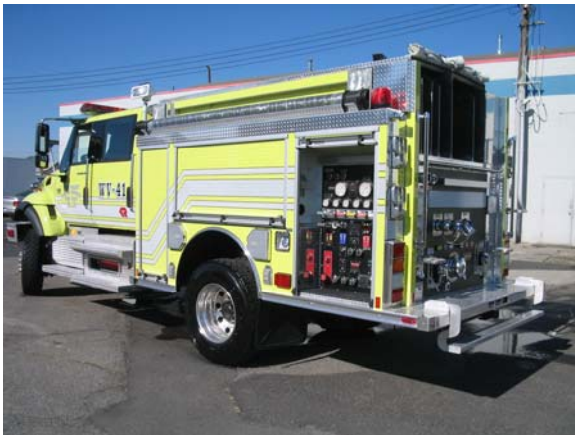
Hinged Aluminum Hosebed Cover & Rear Folding Bumper Step