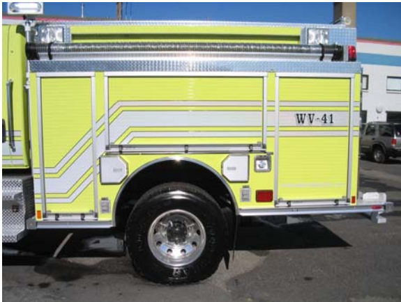
Painted ROM Roll-Up Style Compartment Doors