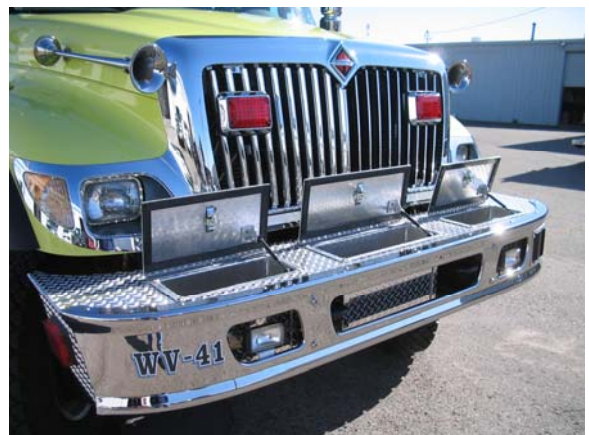
Hinged Storage Bin Between & Outside the Frame Rails