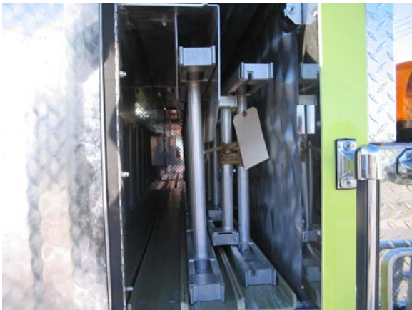
Rear Enclosed Ladder Storage Compartment In Hosebed