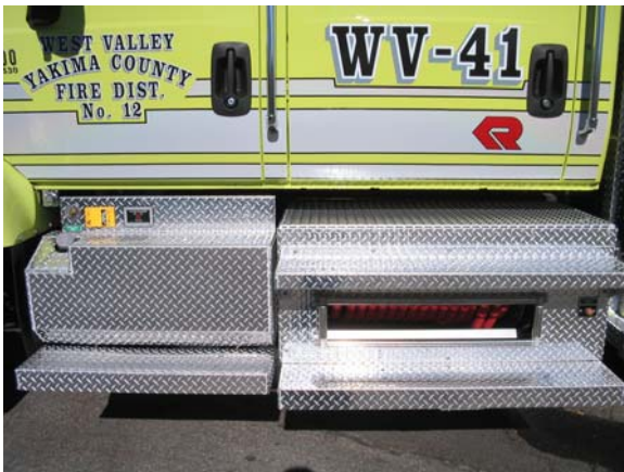
Battery & Air Pump With Auto Ejectors