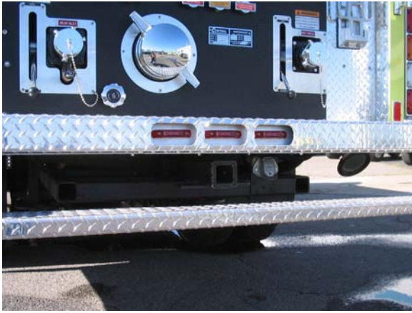
Rear Mounted Fire Pump Discharges & Suction Inlets